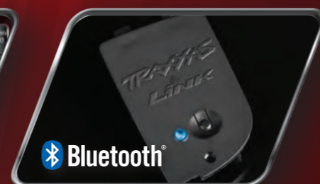
Traxxas Link™ Wireless Module connects with your iPhone, iPad, iPod touch, or Android®