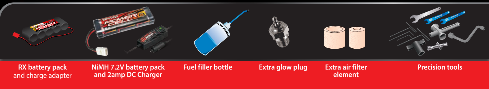
RX battery pack and charge adapter