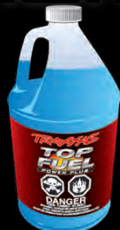
Traxxas Top Fuel® Power Plus™