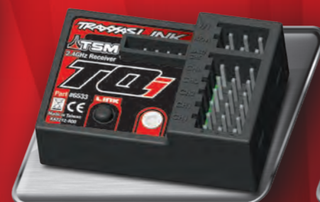
5-Channel Receiver With 3 Telemetry Ports with Traxxas Stability Management™