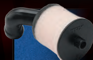
Large Two-Stage Air Filter

The dual-chamber Resonator ™ aluminum pipe delivers the most linear power band from the TRX ® 3.3 Racing Engine. It's dyno-tuned for torque down low and big horsepower on the top end. The extra-fine mirror-polish finish looks great and stays clean longer.