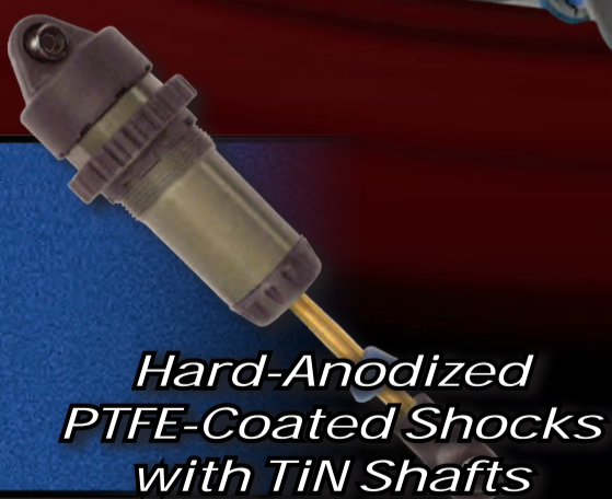
Hard-Anodized PTFE-Coated Shocks with TiN Shafts

Rockers Can Be Changed to Adjust Progressive Rate and Travel