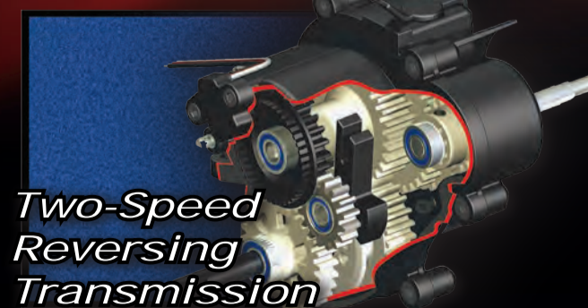
Two-Speed Reversing Transmission

Revo's transmission delivers innovative two-speed, forward/reverse operation in an ultra-compact package. The OptiDrive® electronic shift module uses advanced microprocessor control to sense vehicle speed and optimize forward and reverse shifting. Direction control is performed via a third channel on the transmitter. This revolutionary, patent-pending system allows the transmission to be lighter with fewer moving parts for reduced inertial mass and greater torque handling. OptiDrive provides constant drive engagement for seamless, responsive acceleration.