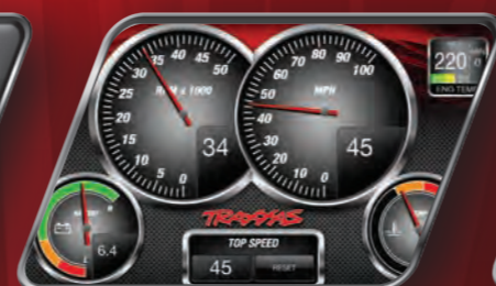
Telemetry Sensors Installed View speed, RPM, temperature, and voltage data on the Traxxas Link dashboard