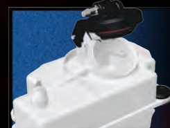
150cc Fuel Tank

Revo's extra large dual-stage air filter increases air flow to the TRX ® 3.3 Racing Engine. The large, free-flowing cylindrical design allows consistent tuning during long races and between maintenance intervals.