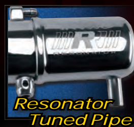
Resonator Tuned Pipe

The dual-chamber Resonator ™ aluminum pipe delivers the most linear power band from the TRX ® 3.3 Racing Engine. It's dyno-tuned for torque down low and big horsepower on the top end. The extra-fine mirror-polish finish looks great and stays clean longer.