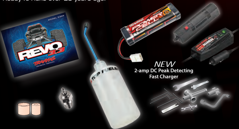
NEW 2-amp DC Peak Detecting Fast Charger

IMPORTANT! THIS PRODUCT IS NOT DESIGNED FOR CHILDREN OR MINORS YOUNGER THAN 16 YEARS OLD. RESPONSIBLE ADULT SUPERVISION IS REQUIRED DURING OPERATION AND MAINTENANCE. Revo 3.3 is very fast and carries one of our highest skill level ratings: 4 (For experienced drivers). Prior experience with R/C models is mandatory. Revo is a high-performance model which is NOT intended for use on public roads or in congested areas where its operation may conflict with or disrupt pedestrian or vehicular traffic. Read all enclosed information before operating. Fully illustrated, step-by-step instructions describe