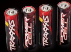
4 AA Alkaline Batteries